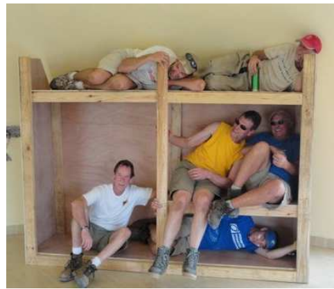
The Carpentry Crew in their closet.