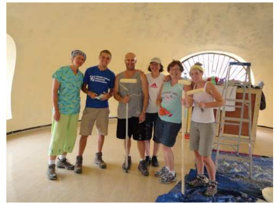
The Paint Crew saying "Frommage" (cheese!)