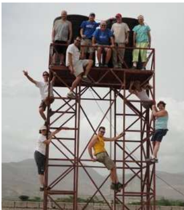
The Mission Team checking out the view from the water tower at the new orphanage compound site.